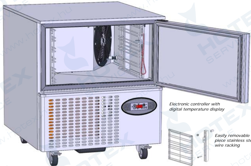
Electronic controller with digital temperature display