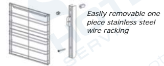
Easily removable one piece stainless steel wire racking