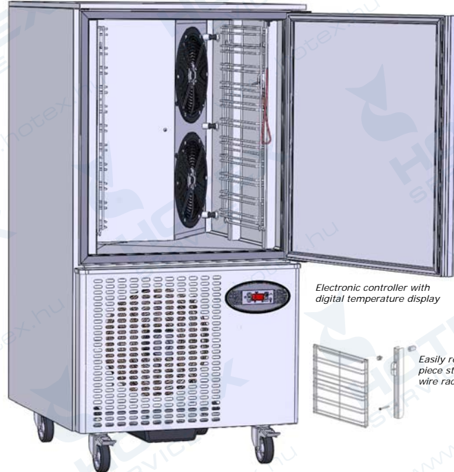
Electronic controller with digital temperature display