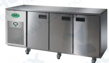
gastronorm three door counter available in: Series 1 - GN 1/1 Series 2 - GN 2/1