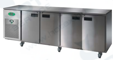
gastronorm four door counter available in: Series 1 - GN 1/4