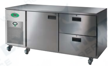
Pro 2/2 two door counter with optional 1/2 drawer option