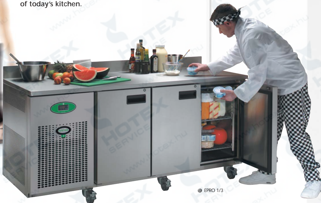
● EPRO 1/3