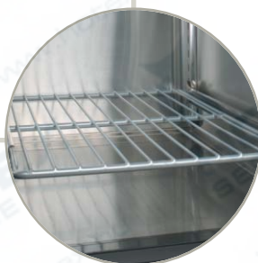
Drawer and shelf weight loading of 40kg