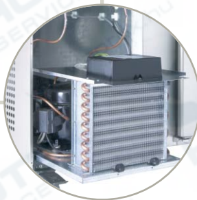
Slide-out refrigeration system gives excellent service access.

GUARANTEEING YOU THE GREENEST REFRIGERATION AVAILABLE