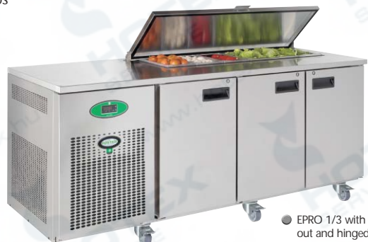
● EPRO 1/3 with saladette cut out and hinged night cover