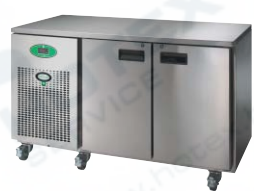
gastronorm two door counter available in: Series 1 - GN 1/1 Series 2 - GN 2/1