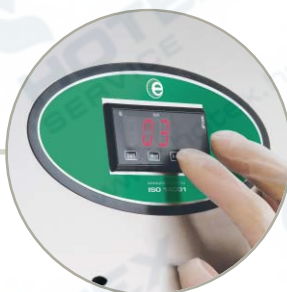
User friendly controls with LED temperature display for easy reference