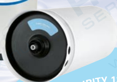
PURITY 1200 Clean Art. 315645