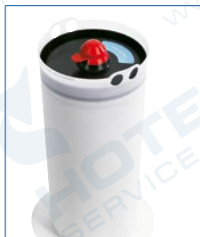
Replacement cartridge PURITY 1200 Clean