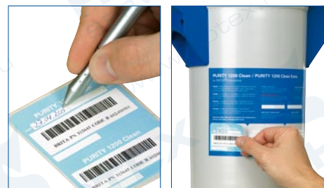
Write the installation date on the sticker and...