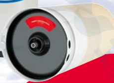
PURITY 1200 Clean Extra Art. 315650