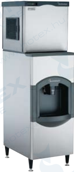
HD22 shown with a Prodigy C0322A cuber