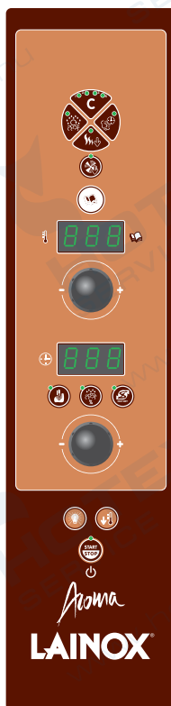
Mod. 064/074 084/104 156

99 program electronics, with automatic 4-cycle sequence - Dedicated key for managing 4 cycles, with displaying LED - Alphanumerical displays - Pre-set recipes - Direct access key to programs and recipes - Self-diagnosis - Autoreverse (automatic inversion of fan rotation) - Lights - Two speed fan; normal/reduced - Power reduction - Manual or automatic controlled humidifier - Automatic vent with pre-opening control - Double-glass opening door - Standard semi-automatic washing program - USB interface for software update, cooking programs and HACCP data download