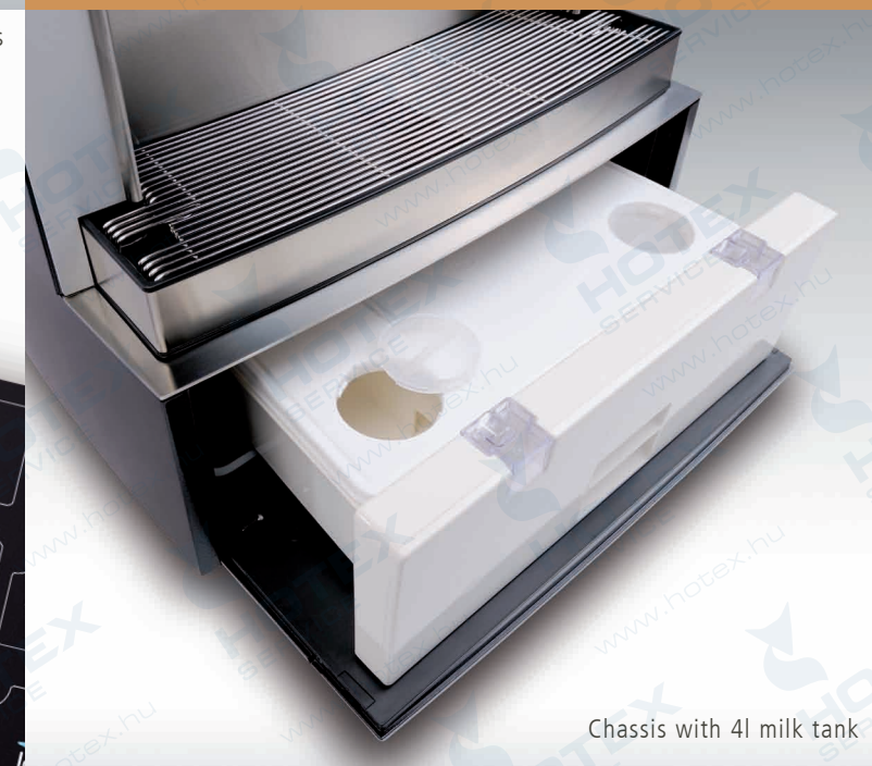
Chassis with 4l milk tank