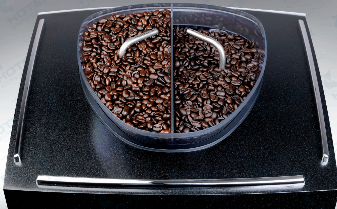
Bean hopper for 2 kinds of coffee