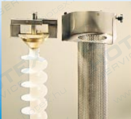
Auger and Screen