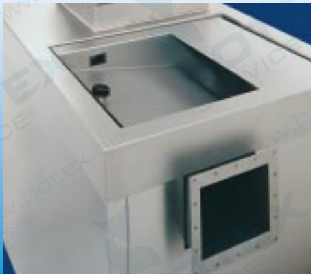
Trough Connection C55T