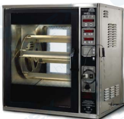
Countertop 6-spit rotisserie, model SCR-6