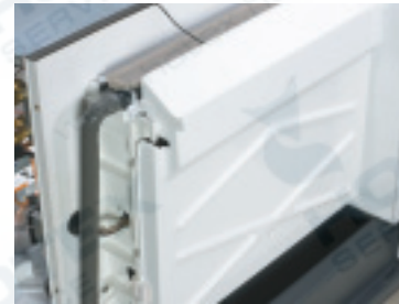
Helps keep your ice fresh and pure