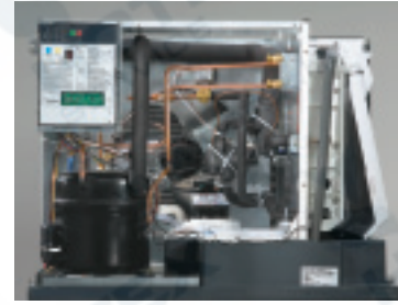
Open design with all components accessible

All Prodigy™ cubers are protected with Scotsman AquaArmor™, which utilizes AgION®, a silver-based antimicrobial compound molded directly into key ice-machine components. This built-in compound reduces the growth of bacteria, microorganisms, algae, mold, and slime on ice-machine surfaces. Match this with Scotsman's other sanitation products to further defend your ice machine against undesirable microbes, bacteria, mold, and algae. Refer to the water filtration and sanitation matrix to match the right cleaning product to your water conditions.