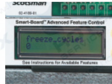
Diagnostic capabilities on screen or transmitted remotely

This optional advanced feature control provides you with operational data that can be displayed on-screen or transmitted remotely for early alert and fast diagnosis of operational issues. With this optional feature, Prodigy™ cubers meet NAFEM data protocol capabilities for smart kitchen applications.