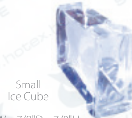
Small Ice Cube