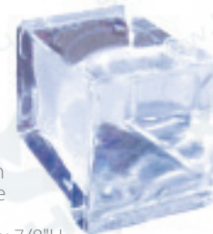
Medium Ice Cube