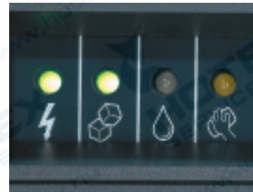
Easily monitor status without opening up the cabinet

Prodigy™ AutoAlert™ external indicator lights continually communicate the machine's current status for complete confidence in its ice-making capability. The ability to immediately alert staff of key operational issues is a valuable tool in maintaining high levels of ice production and minimizing performance interruptions.