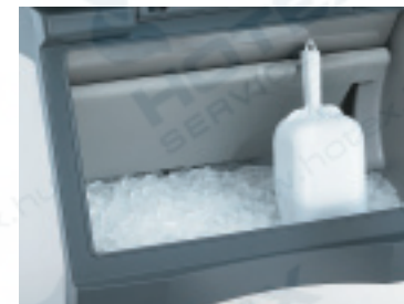
Take complete control of your ice-making level

Using field-proven ultrasonic technology, the Vari-Smart™ ice-level control maintains the ice level you set to keep just the right amount of freshly made ice in the bin. Along with the Smart-Board™ control, this feature allows you the flexibility to program your ice level for up to 7 days. That means customers get fresh ice while you save water and electricity.