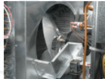
Unique fan-blade design helps reduce noise

With a unique fan-blade design, quieter compressors, and a special sound shield, Prodigy™ cubers reduce the noise of ice making versus competing models. All external panel components are crafted for superior fit and finish and aesthetic appeal. For the ultimate in quiet operation, Prodigy Eclipse offers the ability to locate the compressor, condenser and receiver remotely. Noise and heat are moved away from workers and customers, improving surroundings.