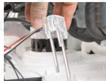
Electric conductivity-based water sensor

The patented WaterSense adaptive purge control reduces scale buildup by detecting hard water conditions and purging mineral laden water with every freeze cycle for maximum reliability and a longer time between cleanings. It constantly measures the minerals in the water and automatically adjusts the purge water amount to minimize scale buildup in every type of water.